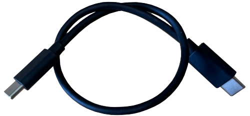
• USB-C Cable