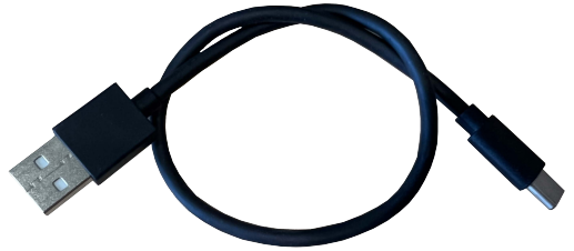
• USB-A Cable