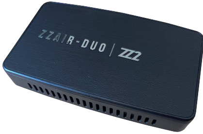
• ZZAIR-DUO Interface